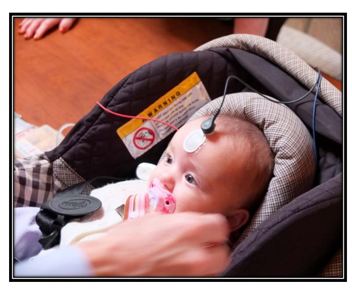
Out-of-Hospital infant receiving hearing screening in Lancaster, Pa.

Representatives from the manufacturer of the portable hearing screening equipment and department staff provide hands-on training to midwife screeners. Each midwife signs an agreement indicating that she has been trained on the use of the equipment, affirming that she will use it only for the purpose of newborn hearing screening, and affirming that she agrees to share the equipment (if in a traveling network). Midwives agree to report monthly screening performance data to the department and to provide information on infants not passing rescreening to the department for follow-up. As a result of a review performed in 2009, the